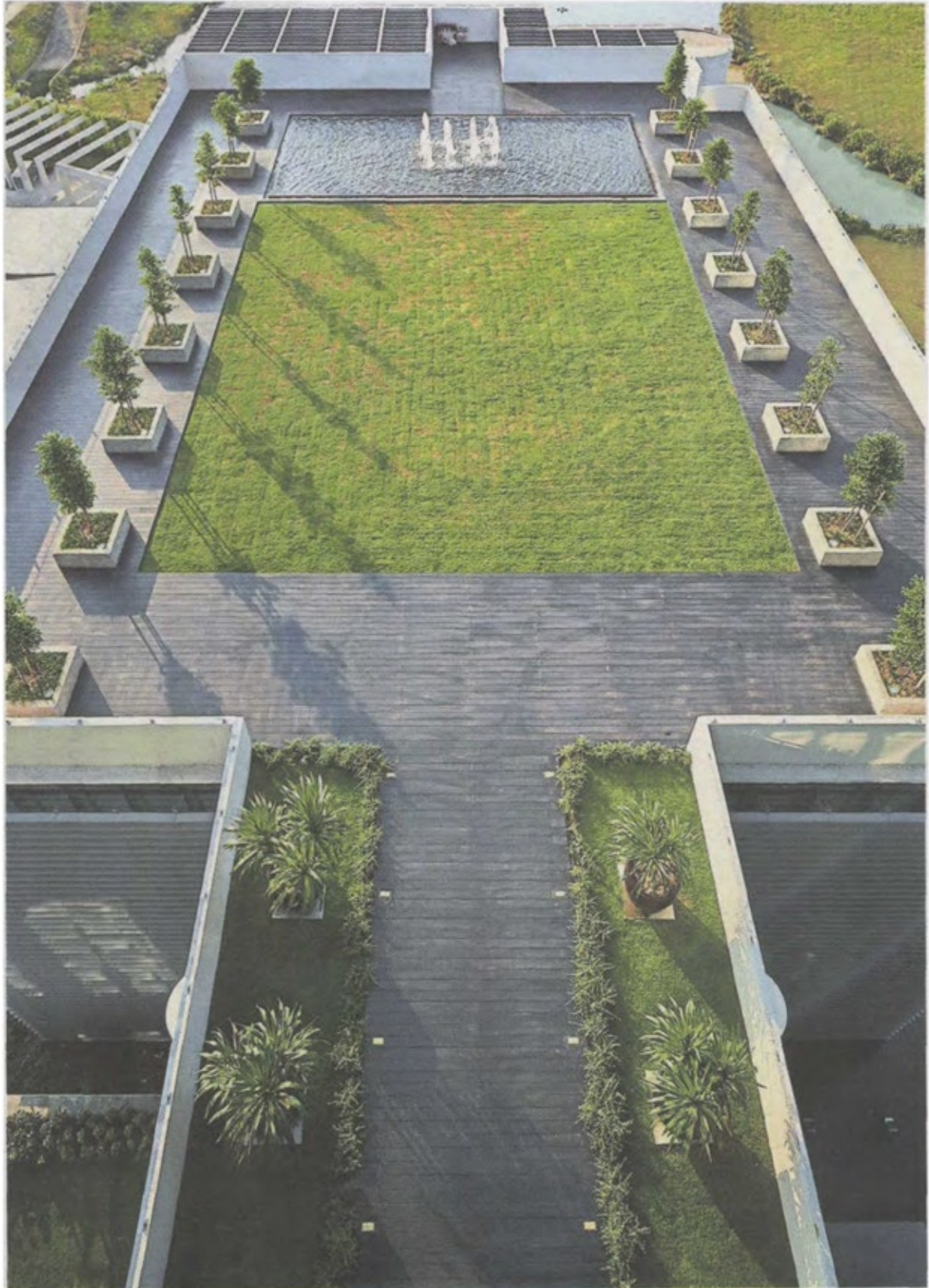
A view of the rooftop garden at SP Setia's Corporate HQ.