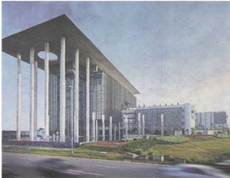
The impressive exterior of SP Setia's Corporate HQ building.