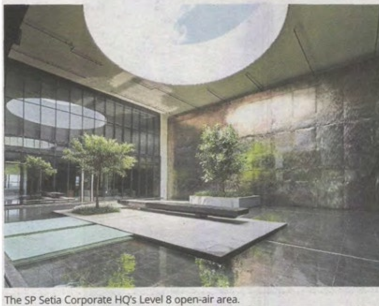
The SP Setia Corporate HQ's Level 8 open-air area.