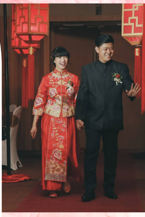
For a minimum guarantee of 300 Pax, you will be entitled to a: