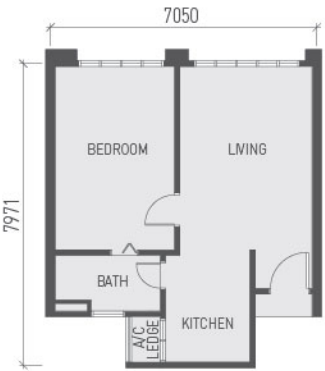
TYPE A 538 SQ. FT.