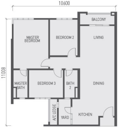
TYPE C 1151 SQ. FT.