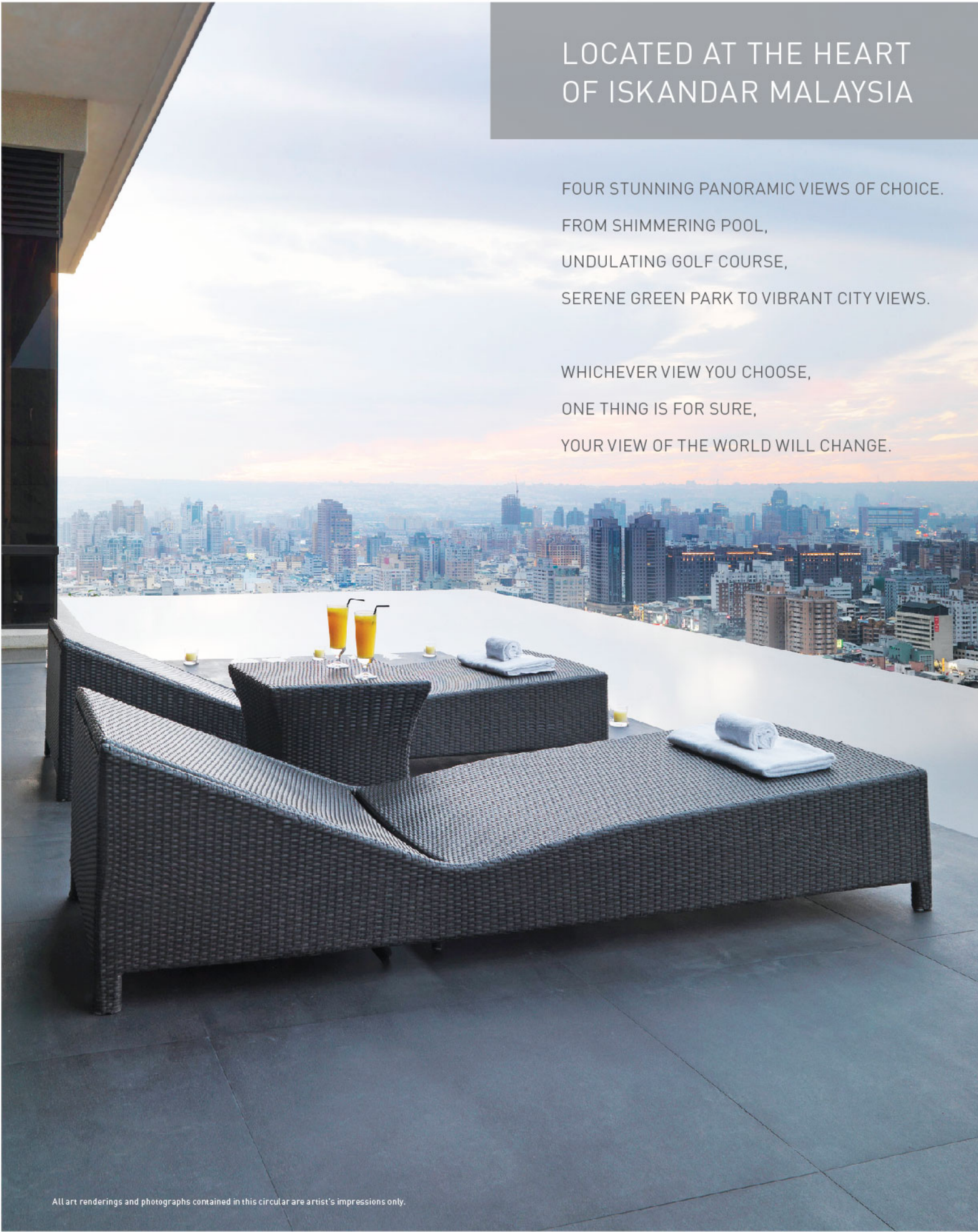
All art renderings and photographs contained in this circular are artist's impressions only.

WHICHEVER VIEW YOU CHOOSE, ONE THING IS FOR SURE, YOUR VIEW OF THE WORLD WILL CHANGE.