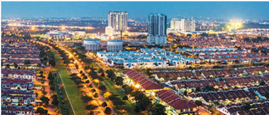
GOLF COURSE VIEW