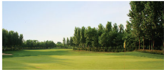
GOLF COURSE VIEW

A renowned township in Johor Bahru with excellent accessibility, Bukit Indah has won numerous accolades for its superb landscaping, quality and design. Popular restaurants, major shopping malls, a hotel and even a convention centre are within walking distance. This vibrant self-contained township replicates the famed Australian Green Street Concept.