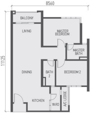
TYPE B 871 SQ. FT.